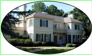
Dublin-Laurens County Chamber of Commerce