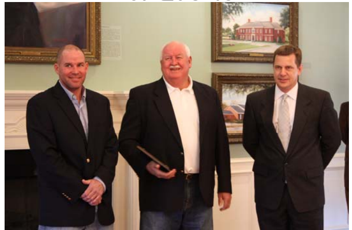
H&H Creek/Clark Construction